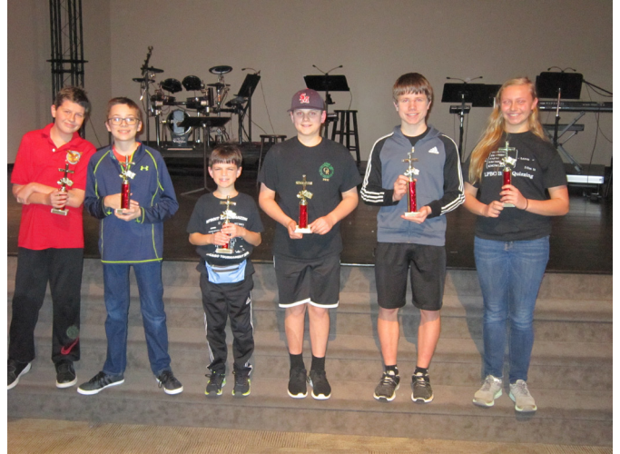
Great Lakes Tournament All Stars