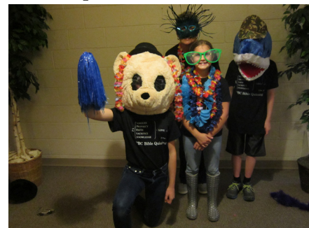
LP Fools for Christ