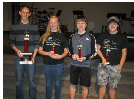
Lake Pointe Varsity

Plan now for Chicago. In March, Detroit Bible Quizzing will put together teams of qualified quizzers to compete at the WBQA Chicago Tournament. To qualify, a quizzer must meet two requirements. The first requirement is to have a 20-point average as a veteran or a 10-point average as a rookie. This season the top seven veterans and the top three rookies have already scored enough points to guarantee themselves the required average. The second requirement is to have a strong attendance record, meaning that you miss no more than one day of quizzing