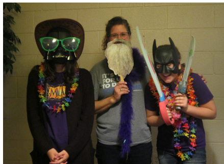
OCS Take the Prize